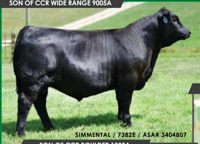
SIMMENTAL / 7382E / ASA# 3404807