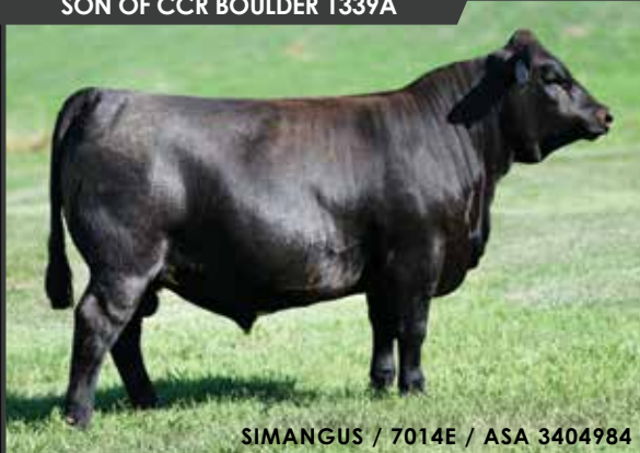
SIMANGUS / 7014E / ASA 3404984